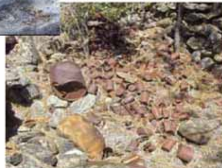
Old Buildings, Cans, or Ceramics

VALUABLE CLUES TO THE WATERSHED'S HISTORY