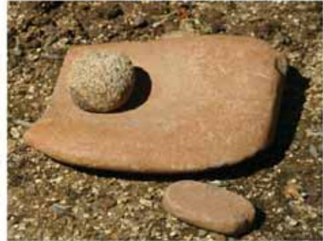
Stone tools and artifacts